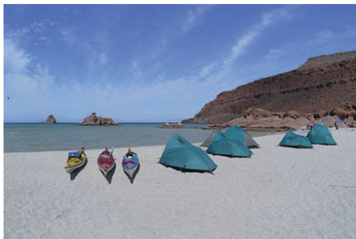
Beach campsite - Baja - Mexico