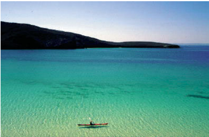
West coast - Isla Espiritu Santo - Mexico

Baja's Isla Espiritu Santo is a kayak wonderland in the Sea of Cortez near La Paz in Mexico. The island is a fabulous wilderness of deserted beaches, protected coves and rugged cliffs. Kayak along this spectacular and varied coastline, camp on pristine beaches, snorkel in the blue waters, swim with sea lion pups and bask in the warm Mexican sunshine. With four days of paddling and three nights camping, the Quick Escape is a perfect winter getaway. No kayak experience is required to have a great time. Skill level 1.