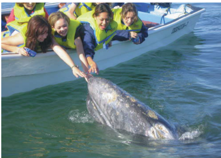
Gray whale - Magdalena Bay - Mexico

We will have fulltime motorboat (Panga) support. The Panga