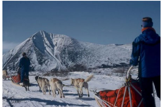
Mushing in the Yukon - Uncommon Journeys

An arctic dog sledding adventure vacation at a luxurious wilderness lodge. Learn to drive a dog team in the amazing scenery of the Yukon's Ibex Valley while enjoying gourmet meals and superb accommodation. You'll be outfitted with the finest dogsledding clothing and equipment. You'll progress from an introductory lesson to day trips and then a 3 day expedition into the wilderness - sleeping and dining at a deluxe heated Yurt Camp. This may be the most unique vacation of your life. Skill Level 1. In co-operation with Uncommon Journeys.