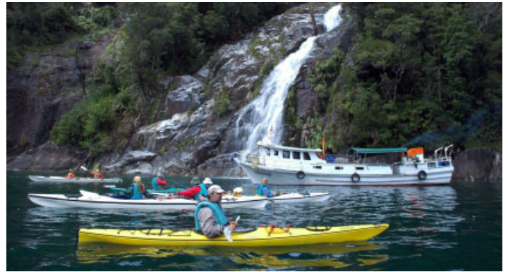
Kayaks and support ship - Patagonia, Chile

Dates: Jan. 10-15, 24-29 Feb. 7-12, 21-26 Fee: $1,250.00 US ex Puerto Montt, Chile