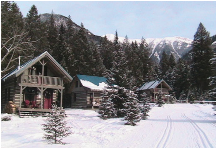
Chalets at Nipika Lodge - Wendy Grater